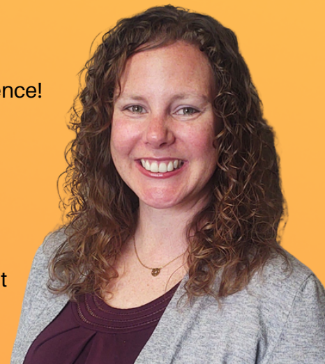
YPN Director of Advancement