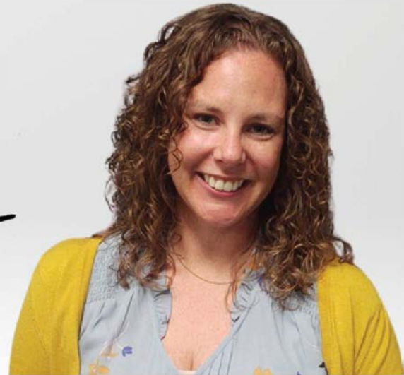
YPN Director of Advancement